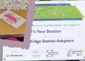
Blythe Bridge station adopters produced a striking artwork panel for the Caverswall Community Art Trail.