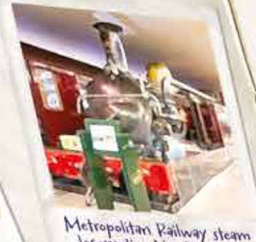
Metropolitan Railway steam locomotive No. 23, 1866