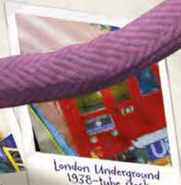
London Underground 1938-tube stock